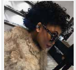
@serrabellum Fashion Blogger